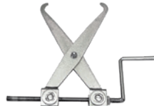
Chain tensioner, scissor type